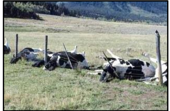
Cows have a tendency to “pile up” against the fences during storms with many leaning against the wire. All these cows were killed by a single lightning strike..

Your best source of up-to-date weather information is a NOAA Weather Radio (NWR) . Portable weather radios are handy for outdoor activities. If you don't have NWR, stay up to date via internet, smart phone, radio or TV. If you're in a group, make sure the group has a lightning safety plan and are ready to use it. If you're in a large group, you'll need extra time to get everyone to a safe place. NWS recommends having proven professional lightning detection equipment that will alert your group when lightning is nearing the event site.