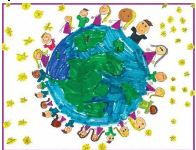
Ready Army invites children and teens to join In, to learn about emergency preparedness, and inspire Army Families all over the world to get ready for emergencies.

Want to celebrate military kids, too? Join us as we PURPLE UP to support our nation's military children on Friday, April 13th. Spread the word around your installation, base, church, school, or place of employment and wear your best purple outfit! Snap a picture and share it with us on social media – we'll be rocking our best purple gear and can't wait to see a sea of purple in honor of some of the most amazing kids we know: military kids!