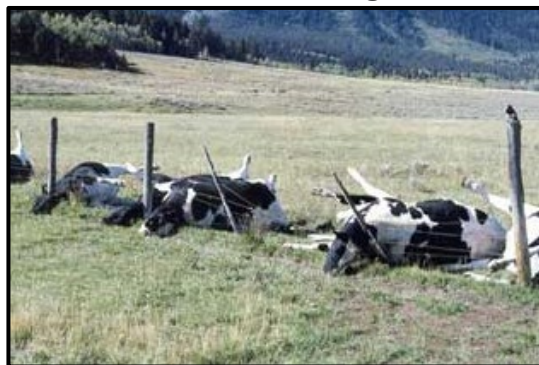
Cows have a tendency to “pile up” against the fences during storms with many leaning against the wire. All these cows were killed by a single lightning strike..

Your best source of up-to-date weather information is a NOAA Weather Radio (NWR) . Portable weather radios are handy for outdoor activities. If you don't have NWR, stay up to date via internet, smart phone, radio or TV. If you're in a group, make sure the group has a lightning safety plan and are ready to use it. If you're in a large group, you'll need extra time to get everyone to a safe place. NWS recommends having proven professional lightning detection equipment that will alert your group when lightning is nearing the event site.