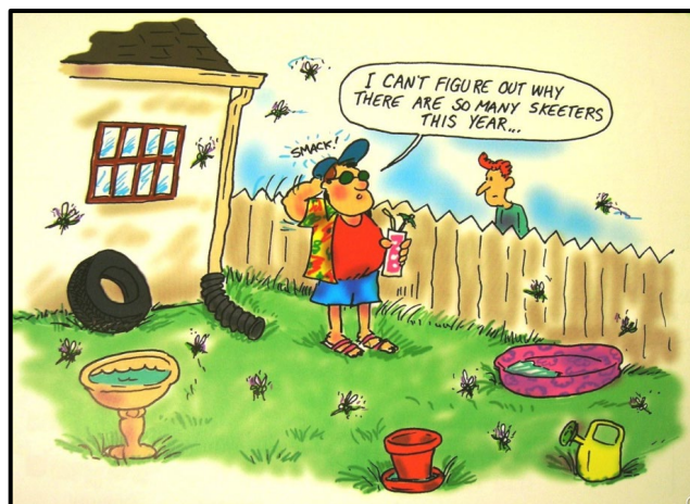
Make sure you don't have any standing water outside that would allow mosquitoes to breed and multiply your problems.